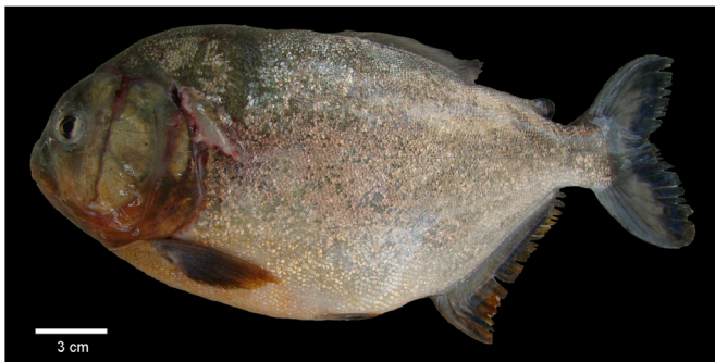
FIGURE 1. Photographic record of the black piranha Pygocentrus piraya collected in the lower and middle course of the Doce River, states of MG and ES, Brazil (Voucher specimens - MZUFV 3946).

Thus, the black piranha is considered exotic in the Doce River and was probably introduced in situ , as was the African catfish Clarias gariepinus (Burchell 1822) in